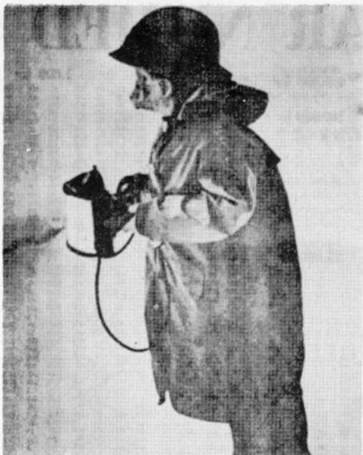
On this page are two views of a model of the little man of Norrbotten, the construction of which was based on the descriptions by the witnesses. . .

place near Mr. Westerberg's home on February 16, 1971. In his own words: 'It was about six o'clock in the evening. I had to go by bus to a neighbour to buy some milk. When I left my home it was already dark. At the bus stop my eyes fell on a dark form in the middle of the road, approximately 15 metres away. It looked like a little man to me. I couldn't see his face; there was just a grey spot there.